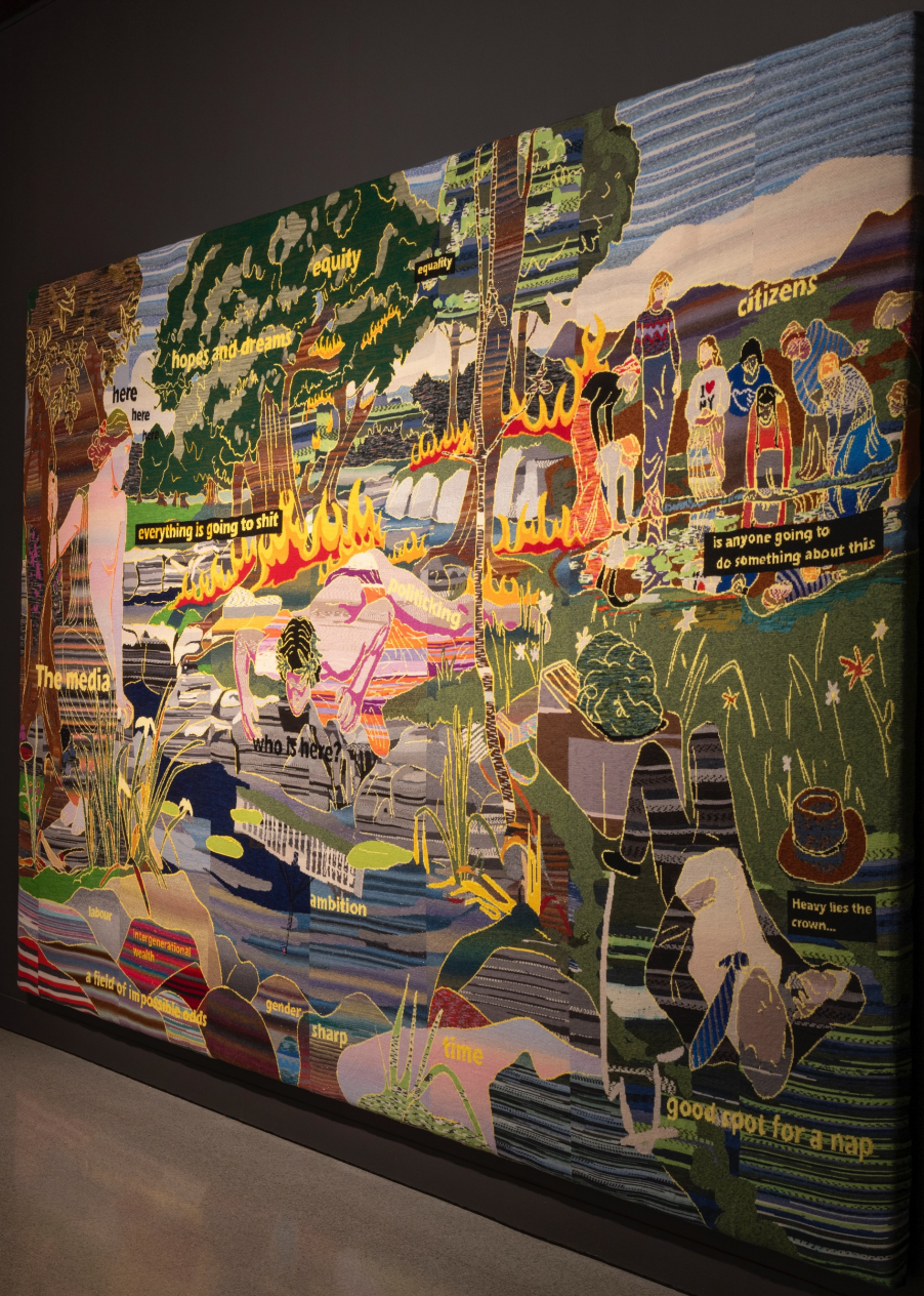
The Pool , 2024, Emma Buswell, knitted wool and lurex yarns, (installation View at IOTA24: Codes in Parallel, John Curtin Gallery) 180 x 270cm and 430 x 270cm