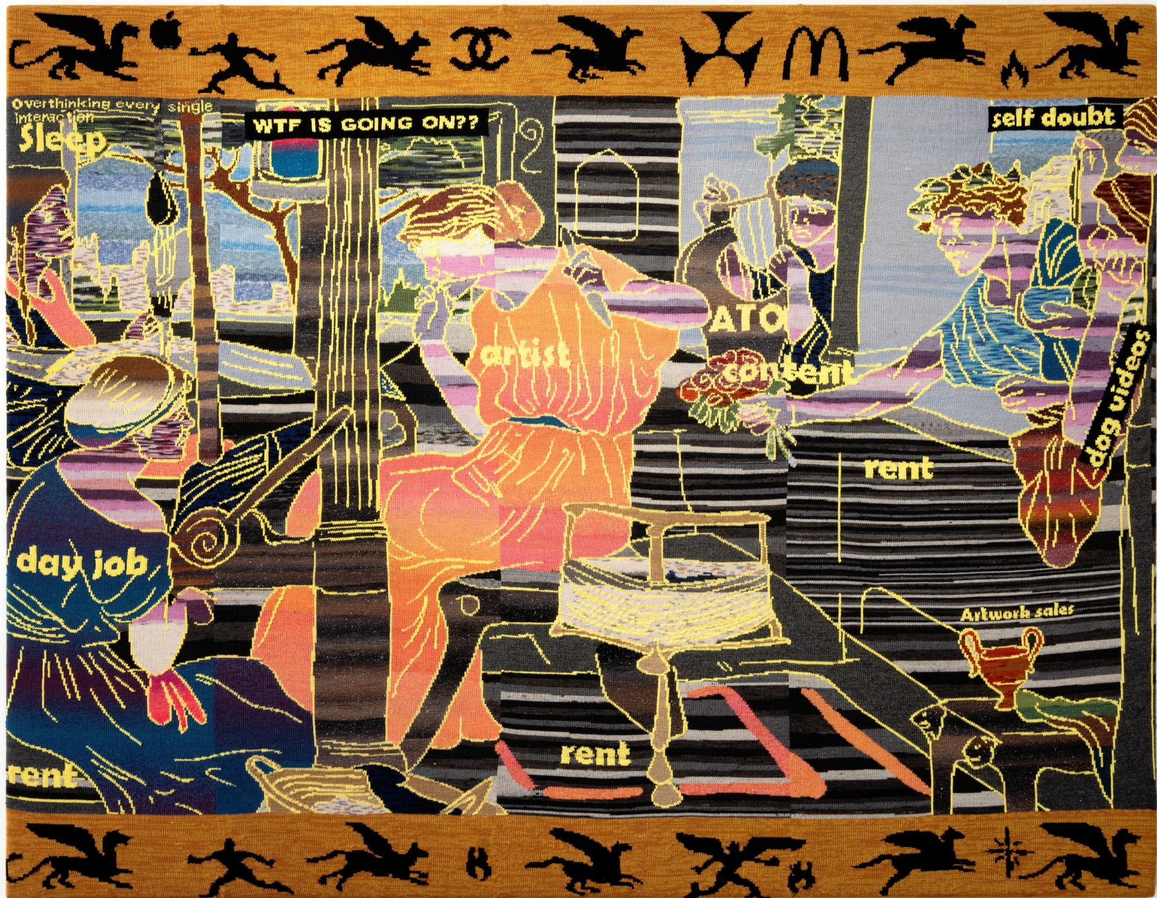
Laertes and Lethargy , 2023, Emma Buswell, 2120 x 1650mm, wool, acrylic and cotton blend yarn