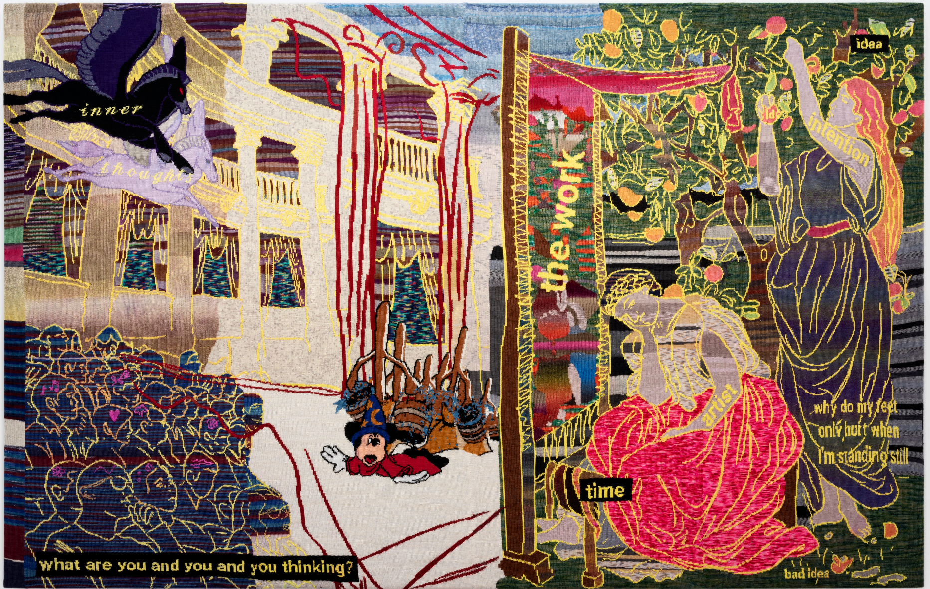
Between Draft and Final Intention , 2024, Emma Buswell, cotton, wool, lurex yarns, 160 x 220cm