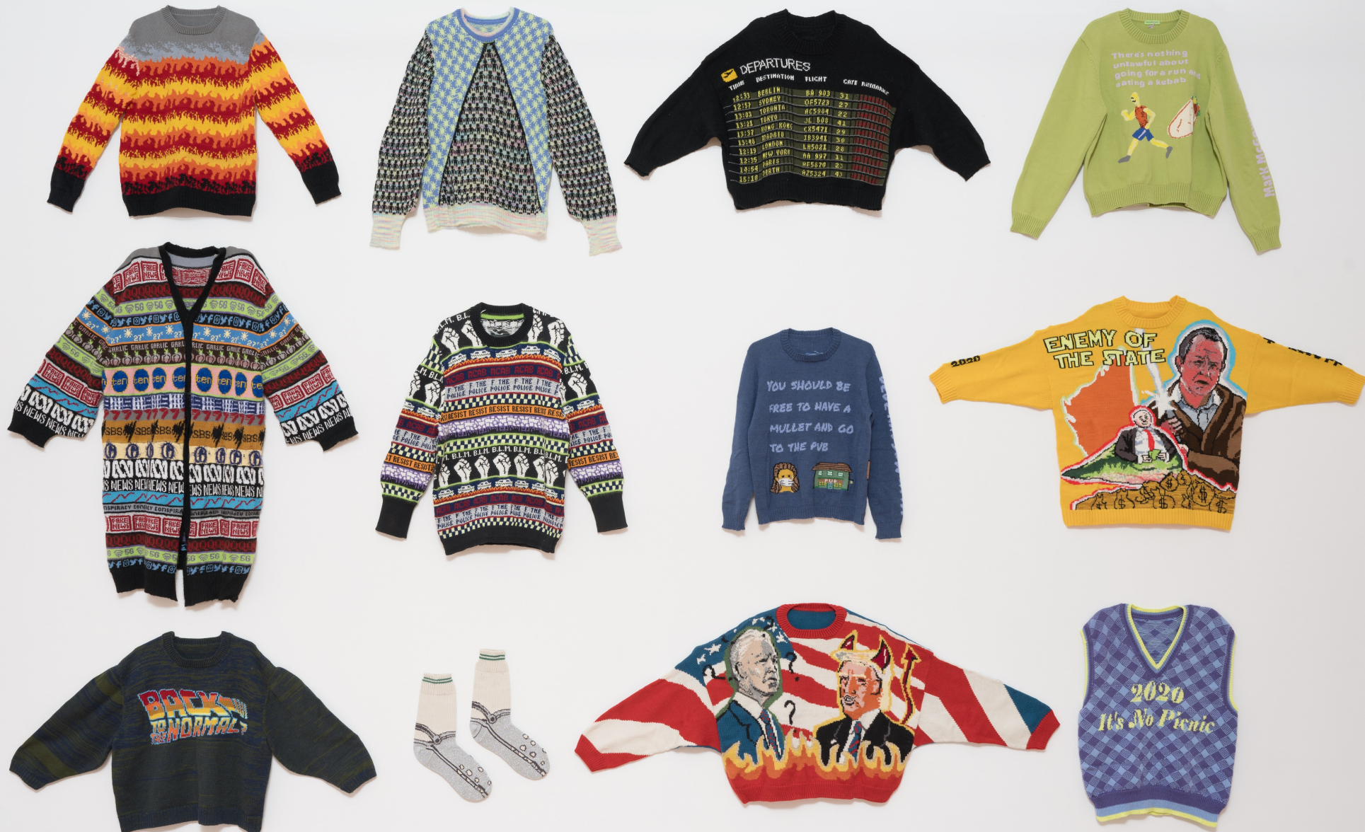
Emma Buswell, After Arachne , (install view), 2021, hand-knitted garments.