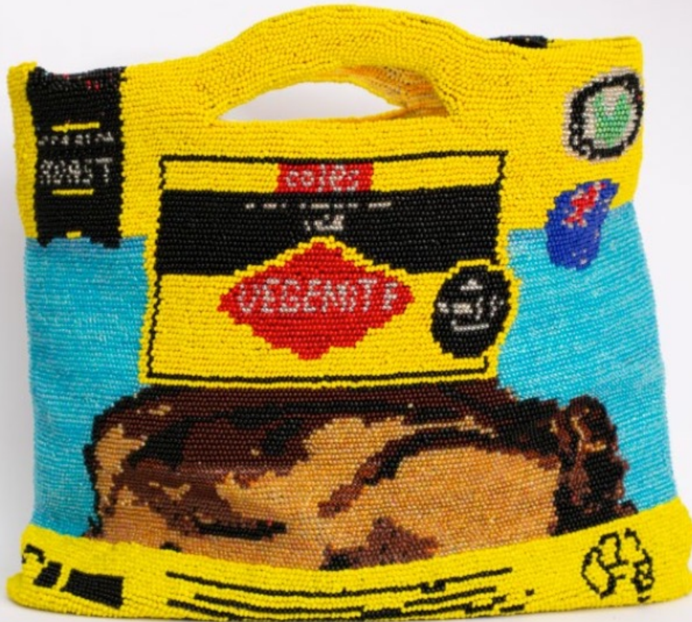
Emma Buswell, Chicken Handbag , 2023 glass beads, cotton and polyester thread, hand crocheted 35 x 10 x 27cm