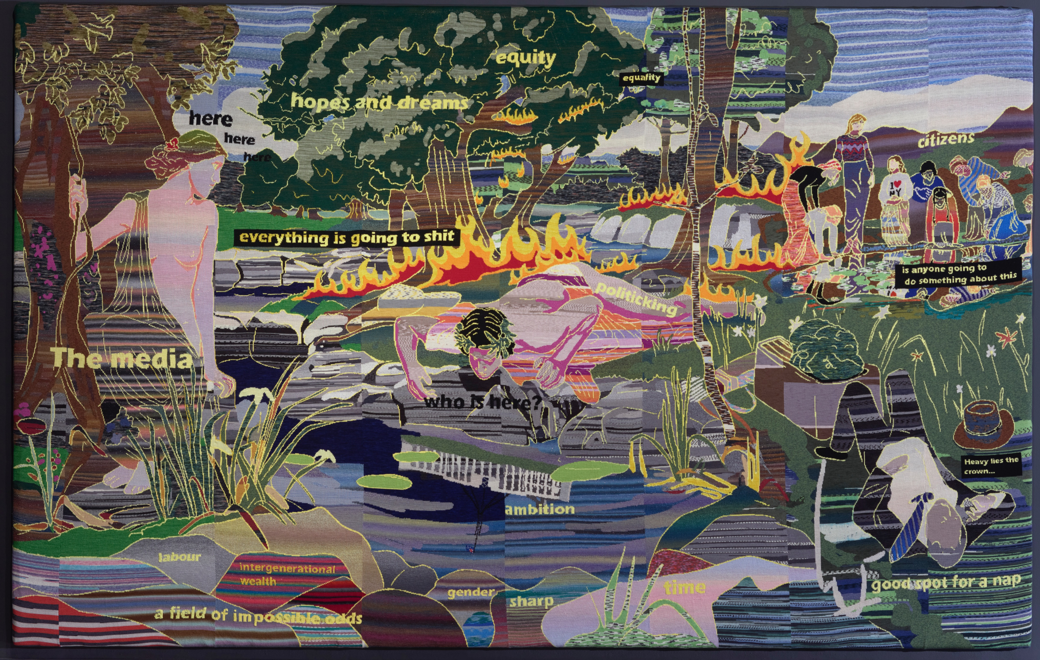
The Pool, 2024, Emma Buswell, knitted wool and lurex yarns, 430 x 270cm